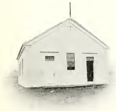
THE SCHOOL HOUSE.